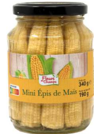
BABY CORN - IMPORT -