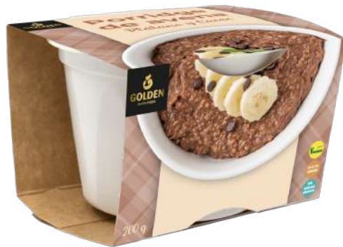
READY MEALS -CUPS-