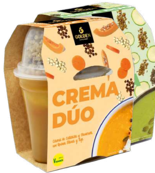
READY MEALS -TO GO-